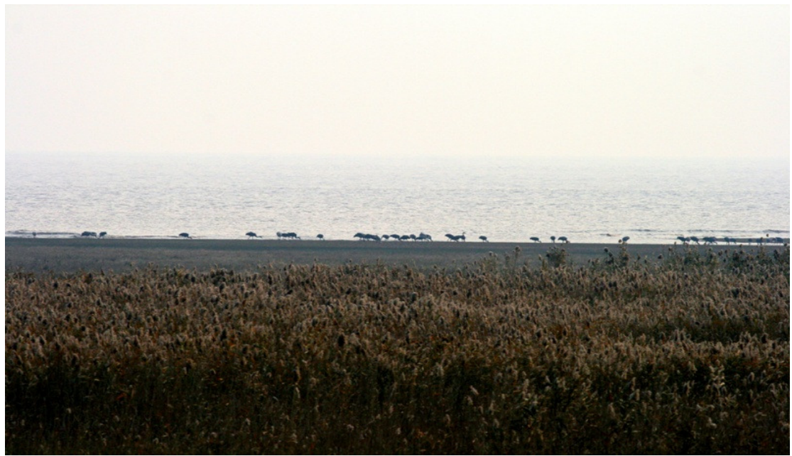
Chongming Dongtan Nature Reserve (CN375) is located at the mouth of the Yangtze River. It is designated as a 'Wetland of International Importance' (or Ramsar site) and is part of the East Asian Shorebird Network. There have recently been new records there of threatened species such as breeding Marsh Grassbird Locustella pryeri and thousands of Baikal Teal Anas formosa .

Key: ● = Protected; ○ = Partially protected; ○ = Unprotected.